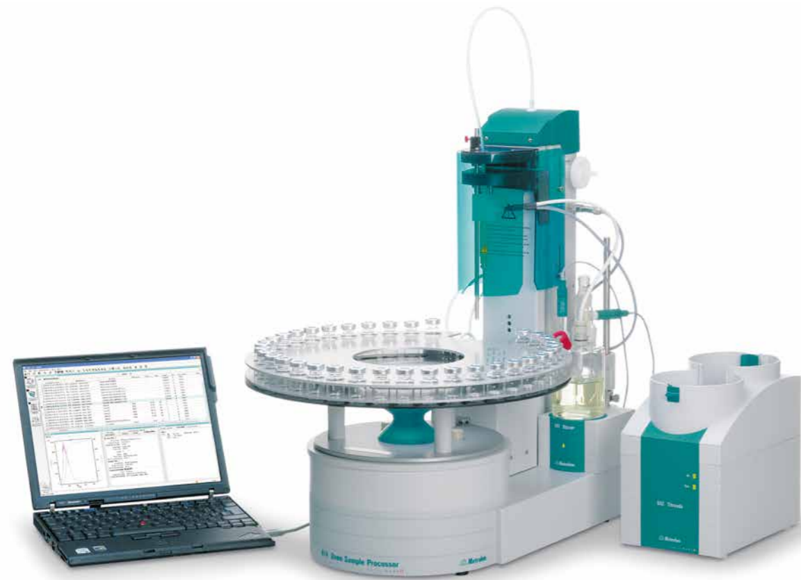
Coulometric titration – 874 Oven Sample Processor 851 Titrand