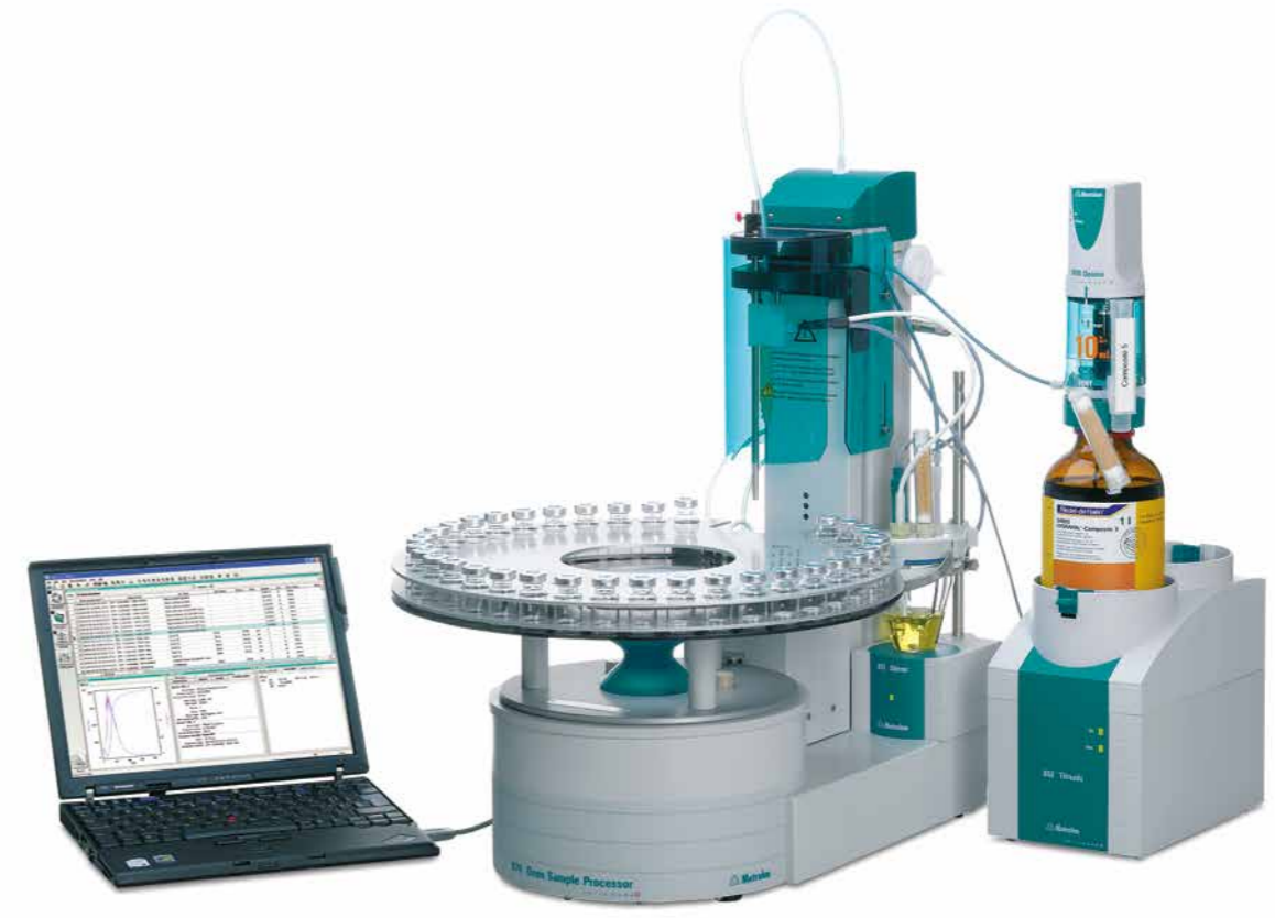
Volumetric titration – 874 Oven Sample Processor with 852 Titrand